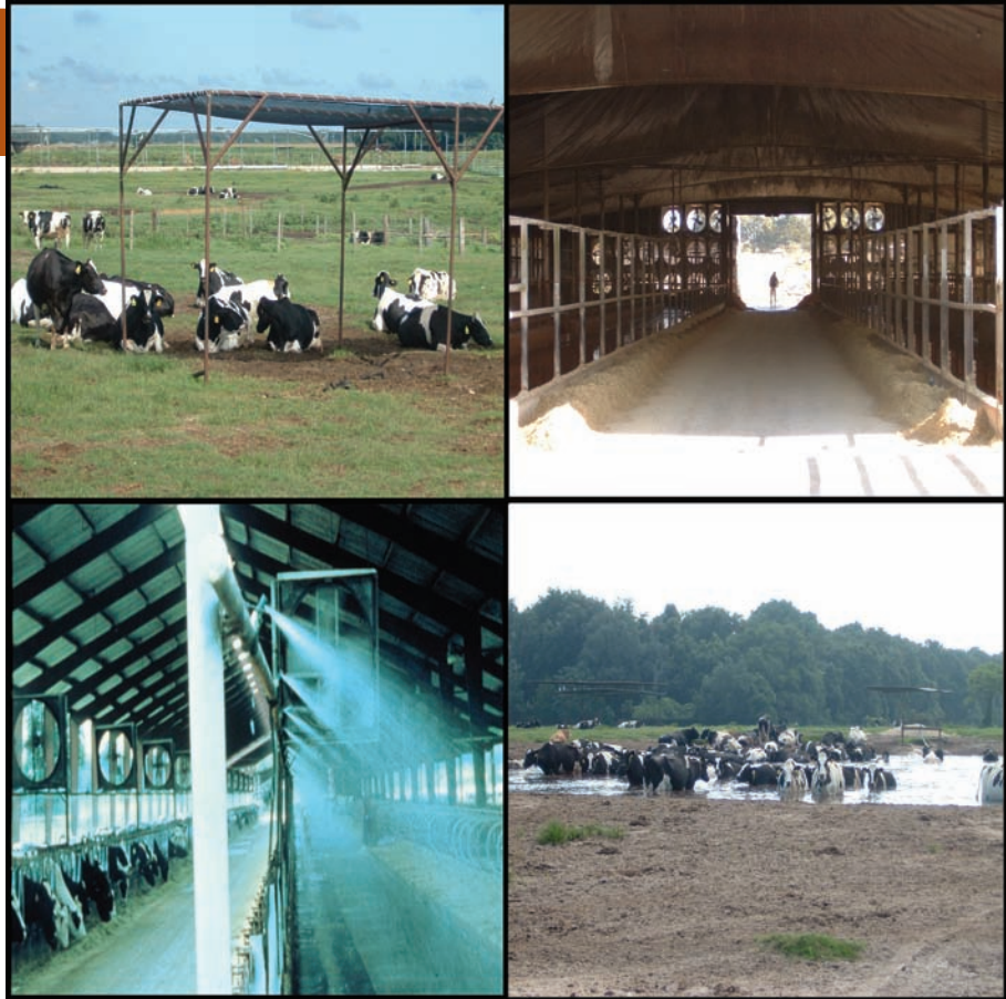
Figure 1. Housing techniques used to cool cows. Shown clockwise from the upper left are cows under shade cloth, a barn with tunnel ventilation, cows enjoying a cooling pond, and a free-stall barn equipped with fans and sprinklers.

Unfortunately, there are no specific treatments to improve fertility of cows bred by A.I. Heat stress results in the formation of a defective egg whose damage cannot be reversed. Even if the egg escapes heat stress and gets fertilized, the embryo is susceptible to damage caused by