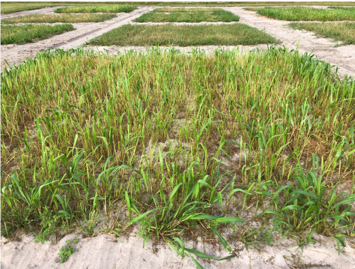
Spain 1 week after harvest - Gainesville

There was a species x month interaction for forage accumulation at Ona. The interaction occurred because Camello and Spain had greater forage accumulation than Jiggs in July, August, and September, but there was no difference among species in June. Spain had the greatest annual forage accumulation, followed by Camello, and Jiggs had the least forage accumulation. There was no harvest frequency effect on forage accumulation. However, forage harvested every 3 weeks had greater CP, IVDOM, and NDFD than at 6 weeks. Jiggs had greater CP concentration but lesser IVDOM and NDFD than Camello and Spain. In Gainesville, Spain and Camello had greater forage accumulation than Jiggs and Newell. In addition, Spain had greater herbage accumulation than Camello in June and September. There was greater herbage accumulation for Camello, Spain and Newell harvested at 6 than 3 weeks; however, there was no difference between 3- and 6-weeks harvest frequency in Jiggs.