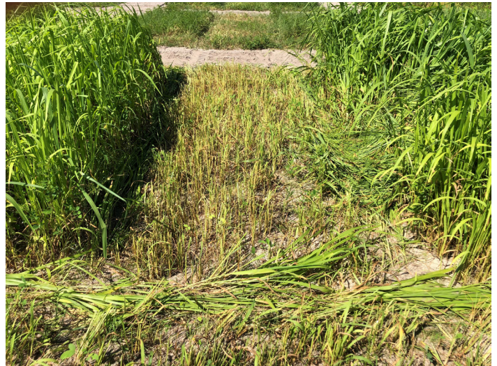
Spain 6 weeks after harvest - Gainesville